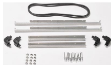
iM27XX-BEZEL-LID Lid Bezel Kit